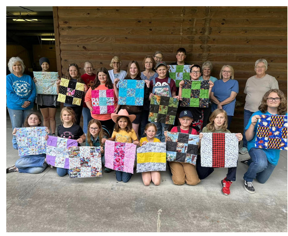
Heritage Day campers and volunteers display their quilt squares.